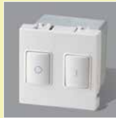
CW217WHI Motor Starter