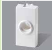
CW462WHI Satellite Cable TV Outlet - 1M

RJ45 CAT6 Computer Jack L - 45mm, B - 22.4 mm, D - 32.3 mm; RJ11 2 Line Telephone Jack with and without shutter L - 45mm, B - 25mm, D - 18.10mm