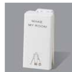
CW415WHI 1 Way Switch MMR - 1M