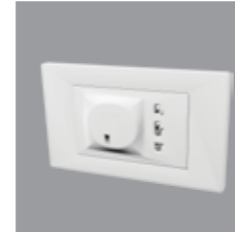
CW529WHI Shaver Socket

Citric hospitality range is smart energy saving specially designed for the hotel industry. It saves energy without compromising the comfort of the guest. Feature packed and with superior aesthetics, Citric range of hospitality products are in complete synergy with the hospitality industry requirements. The range is convenient, safe and efficient.