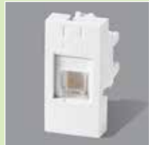
CW493WHI RJ45 CAT6 Computer Jack - 1M