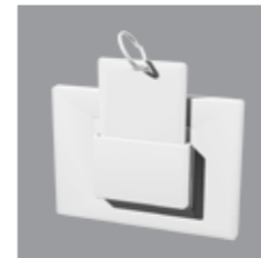
CW527WHI 20A Energy Key Switch with Time Delay