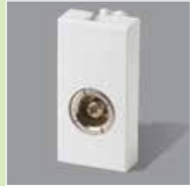
CW451WHI TV Coaxial outlet - 1M

Citric communication range consists of TV coaxial - 1M, Computer jack - 1M and Telephone jack - 1M. The entire range is designed for maximum data and voice transfer efficiency. Features in the range are designed to deliver minimal signal loss, ease of installation and low maintenance.